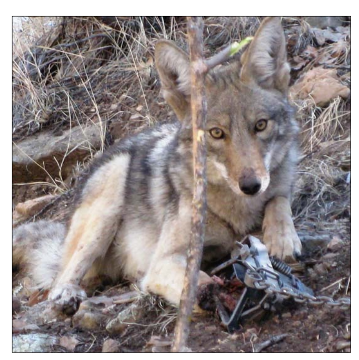
Trapped animals fight for their freedom and many sustain catastrophic injuries while ensnared.

Animal traps fall under two categories: restraining or killing. Restraining traps hold the animal until the trapper arrives to kill it. Kill traps are designed to cause immediate death and are used either terrestrially or underwater. The terrestrial traps snap the neck or