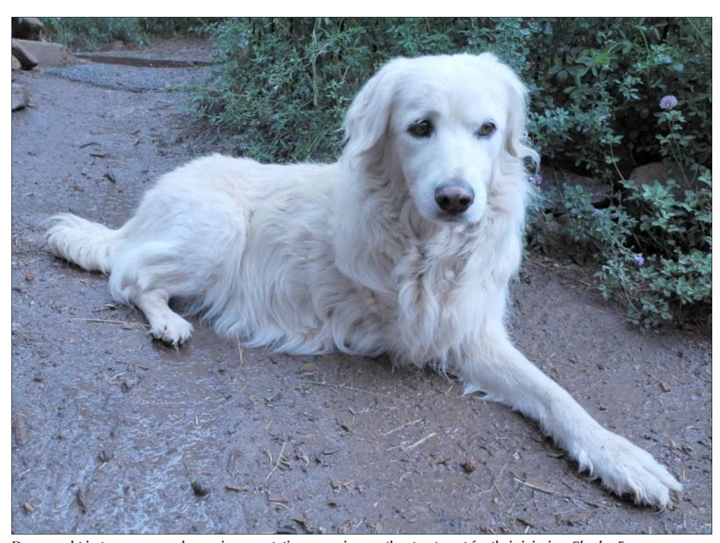
Dogs caught in traps commonly require amputation surgeries or other treatment for their injuries. Charles Fox

These professionals cited pain and stress, and harm to non-target species as the two primary reasons for