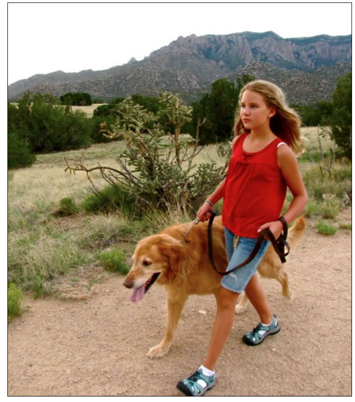
To save time, trappers may set traps close to trails, roads, and campgrounds, which can expose people and pets to dangerous traps. Cat Cannon

spine of captured animals. Traps do not discriminate between similar species and often catch non-target animals.