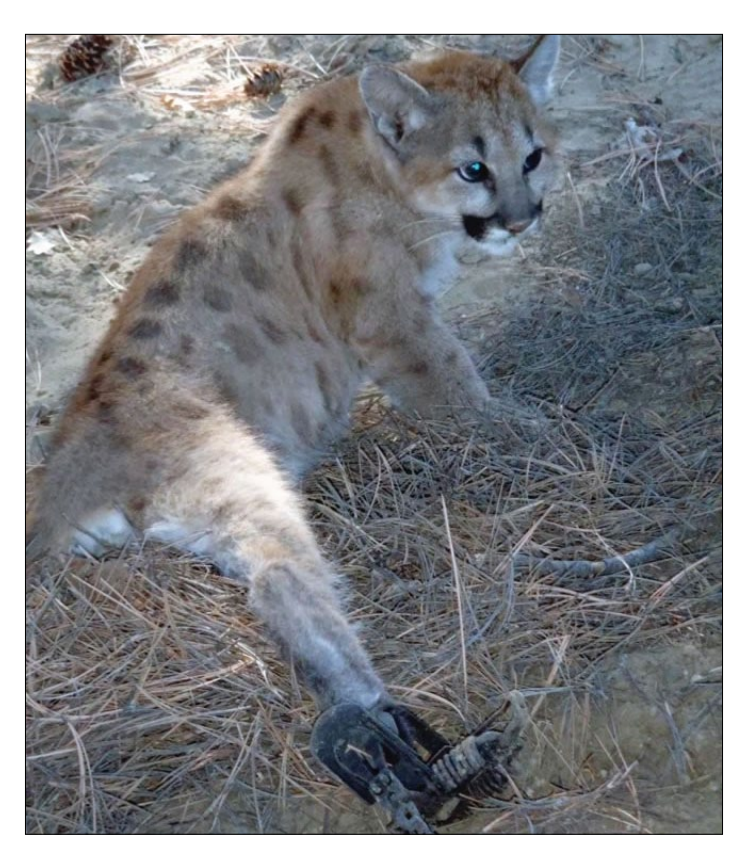
While most states do not allow for take of cougar kittens, traps do not discriminate between species. A cougar kitten, even if released, may be orphaned and die of starvation.

In addition, many states have no bag limits (that is, trappers can kill as many animals as they can capture) such as in Colorado and New Mexico. The number of animals killed by trapping is not driven or dictated by wildlife populations or management objectives. It is largely driven by demand and commercial fur prices. If fur prices rise, trapping increases, and the number of furbearing animals (and non-target species) removed from the ecosystem increases.