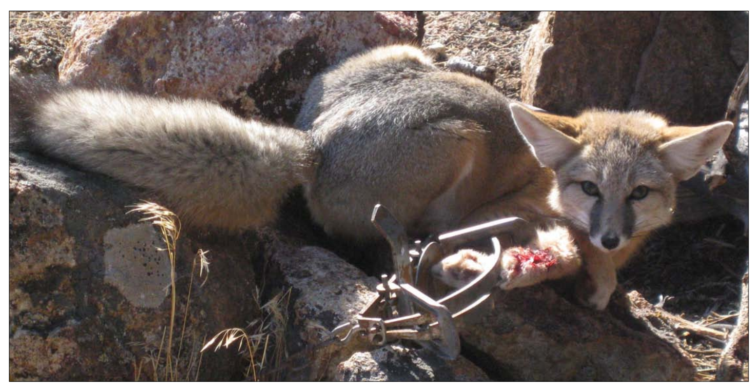
Despite their precariously low numbers, swift foxes are still trapped even as their pelts are practically worthless on global fur markets.

Trappers often place their traps on public lands, including on U.S. Forest Service, Bureau of Land Management and state trust lands. Traps may be set almost anywhere. While states typically have mandatory set back distances from roads, trails and other human facilities, companion animals are often still trapped. Neither trappers nor land management agencies are required to share information on trap placement or post warning signs that trapping is occurring in a local area.