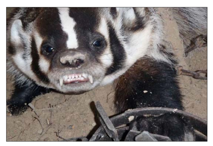
Nearly trapped to extinction in the past, the badger has rebounded in some parts of the West. State population data is lacking, however.

Prohibiting the use of indiscriminate traps will balance management with the expectations of the majority of the public and will help ensure public safety. It will also protect individuals from enduring the emotional and financial strain of dealing with the loss or injury of their companion animals to the jaws of a trap.