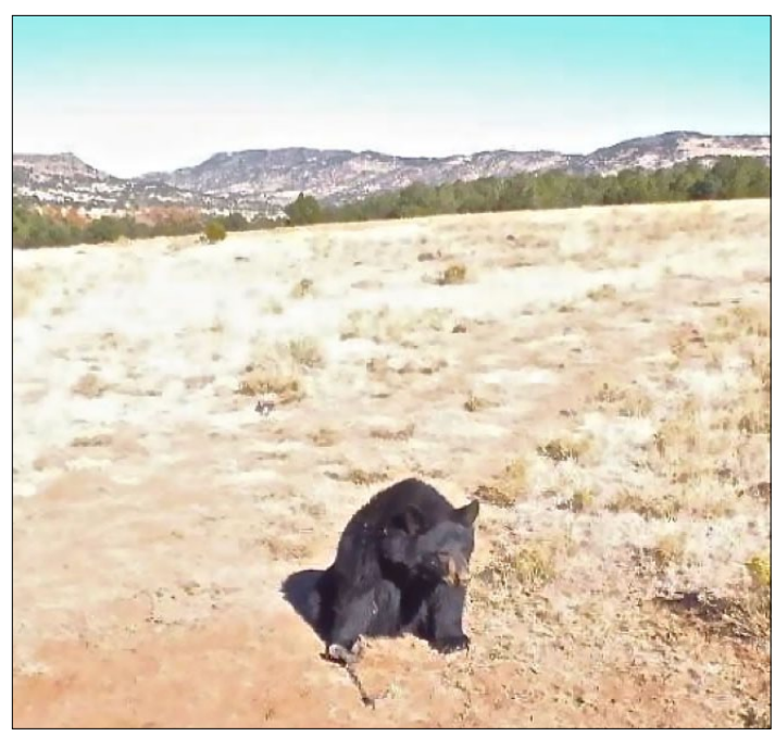
Many states do not permit bear trapping, but this black bear was incidentally trapped in New Mexico.